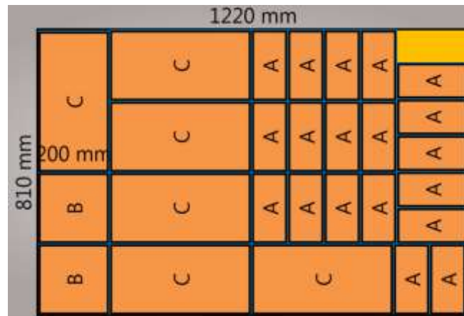
Sample of Optimised sheet

The image on the screen does not show the dimensions of the components, but the optimised sheet can be printed out and it will have all the dimensions of each component shown. The program can just as easily be used to calculate components from board stock. If this sounds like a useful program that you would use, it can be downloaded from http://www.maxcut.co.za/