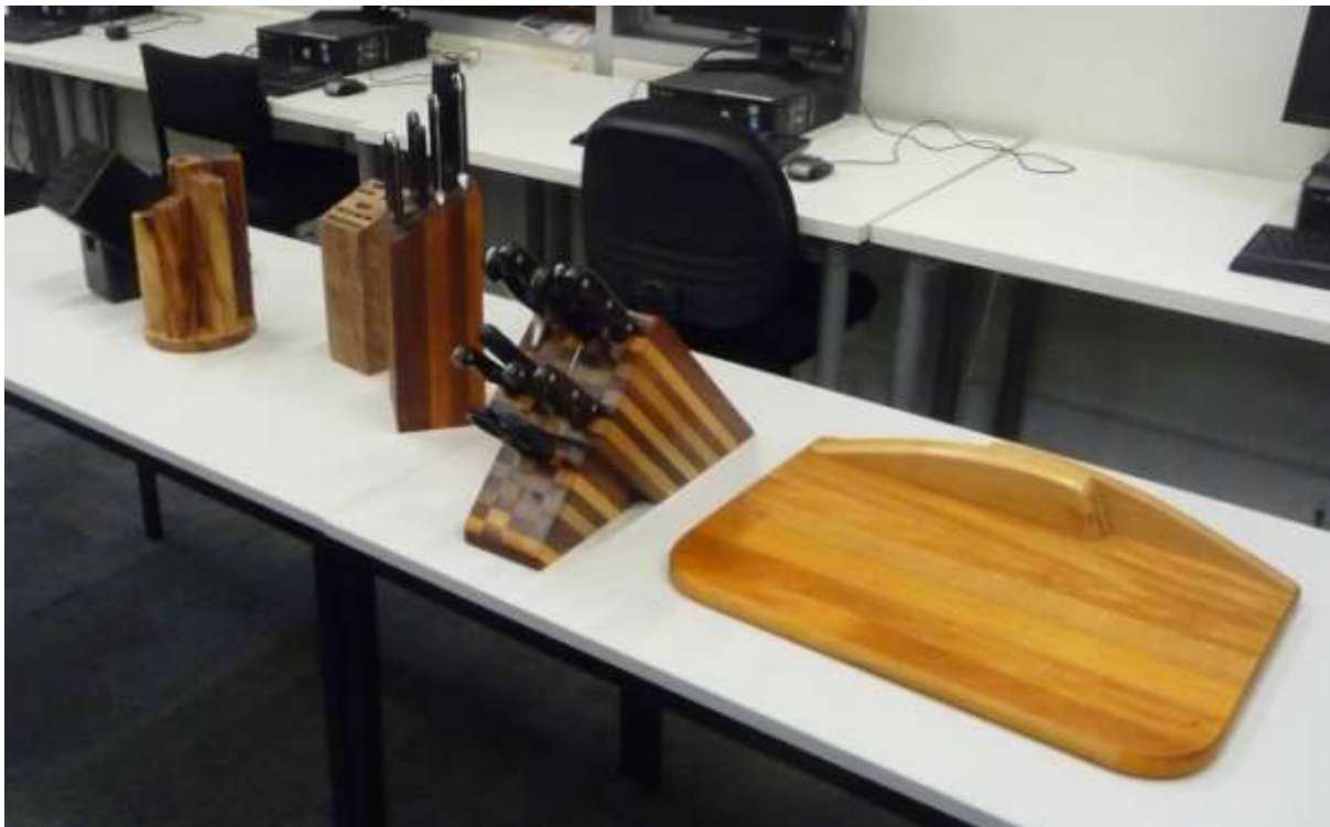
The members fantastic work at the last meeting.

The image on the screen does not show the dimensions of the components, but the optimised sheet can be printed out and it will have all the dimensions of each component shown. The program can just as easily be used to calculate components from board stock. If this sounds like a useful program that you would use, it can be downloaded from http://www.maxcut.co.za/